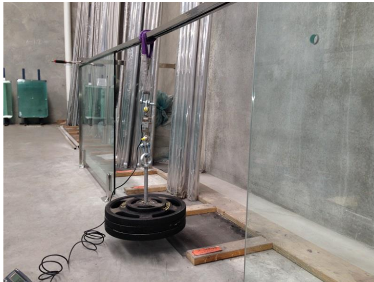
25X50 Rectangle slotted tube under the test No signs of damage or loosening.